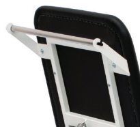
Paper roll holder