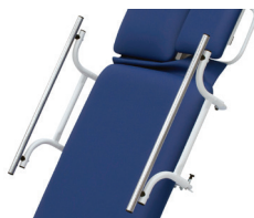
Fold down side rails