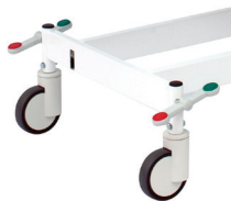
Central wheel locking